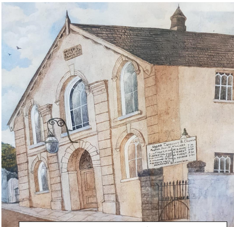
The earliest known image of Upper Trosnant